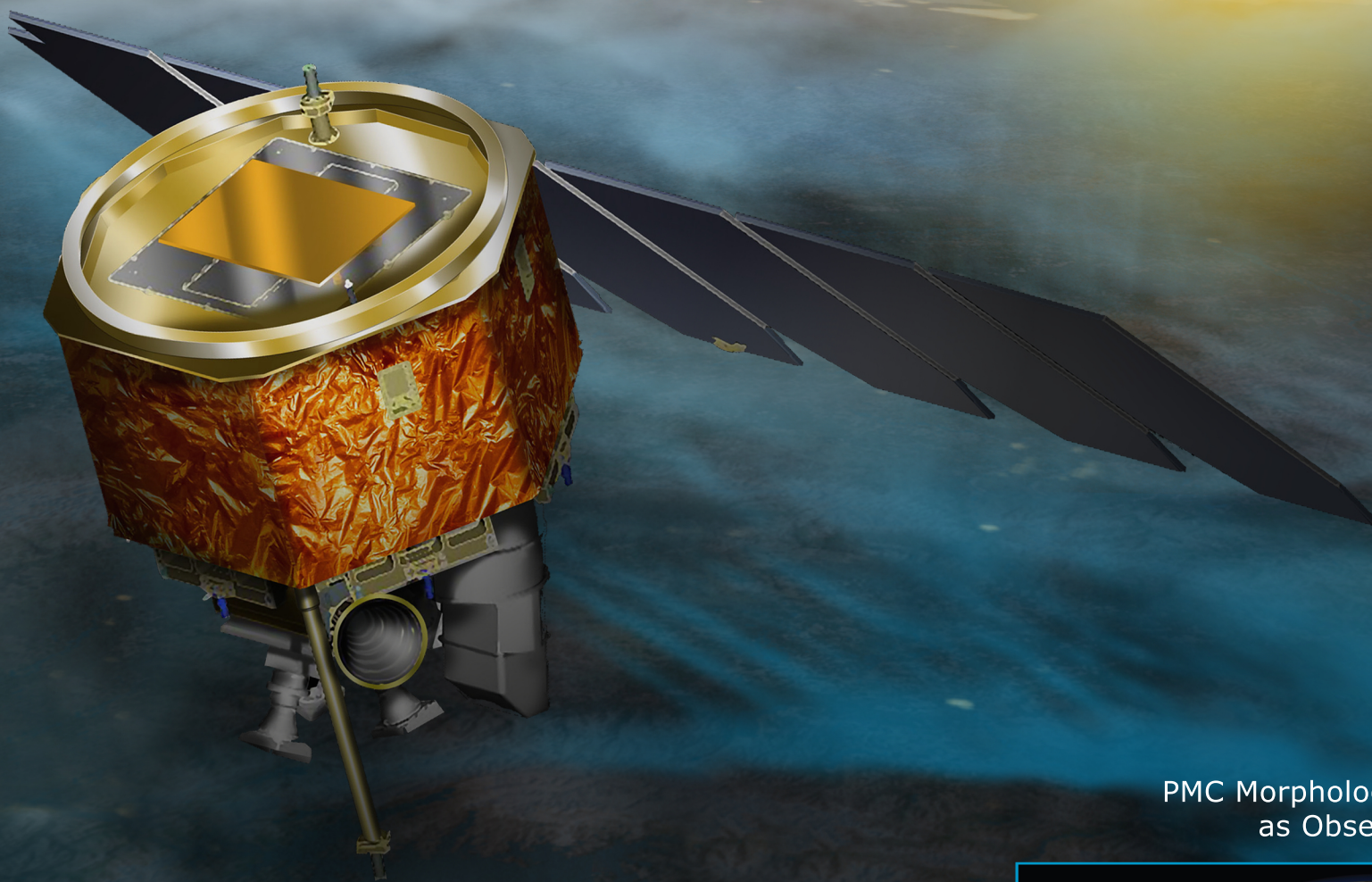
PMC Morphology on July 15, 2007 as Observed by CIPS